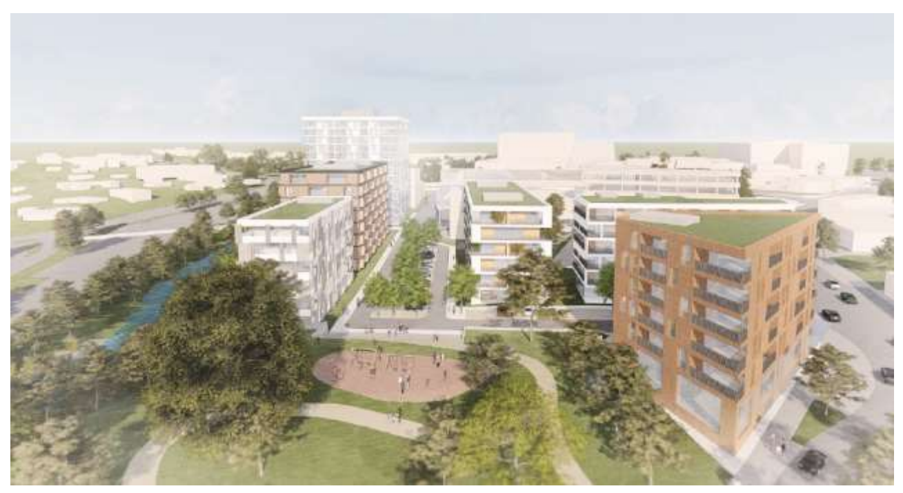
Figure 4: Henderson town centre development

Panuku partnered with Kāinga Ora to analyse 29 sites for development potential, based on access to sustainable transport, stream amenity, and regeneration potential. This resulted in a concept for up to 350 additional family homes in the town centre.