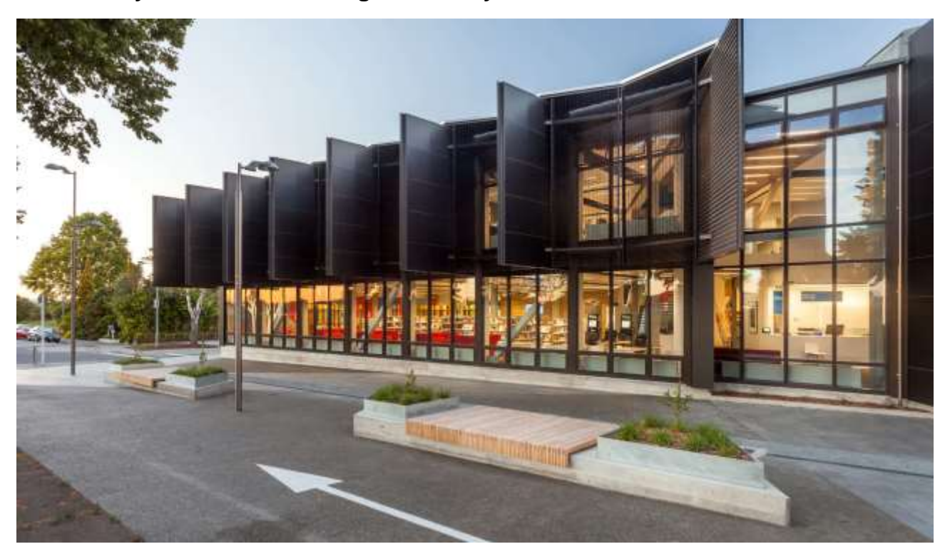
Figure 13: Te Manawa Westgate Library

The Westgate Library and multi-purpose facility is the anchoring civic component of the new Westgate town centre development.