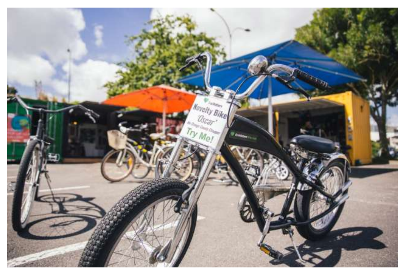
Figure 5: Try a Bike at the Henderson Bike Hub