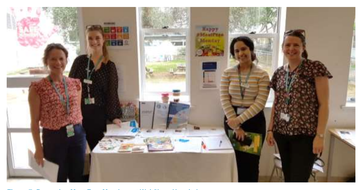
Figure 7: Promoting Meat Free Mondays at Waitākere Hospital