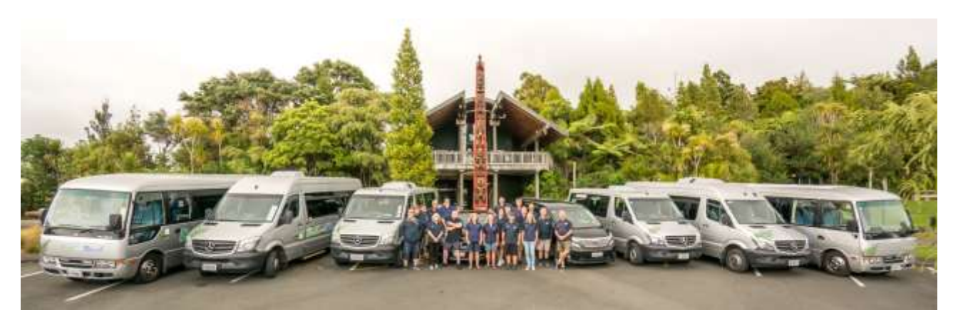
Figure 6 The Bush and Beach team photographed with some of their fleet at the Arataki Visitor Centre

Bush and Beach is targeting a 2 per cent reduction in carbon emissions per year. They're also keeping an eye out on the market for electric buses with a range of up to 500km. It is this switch which will really slash their future carbon emissions.