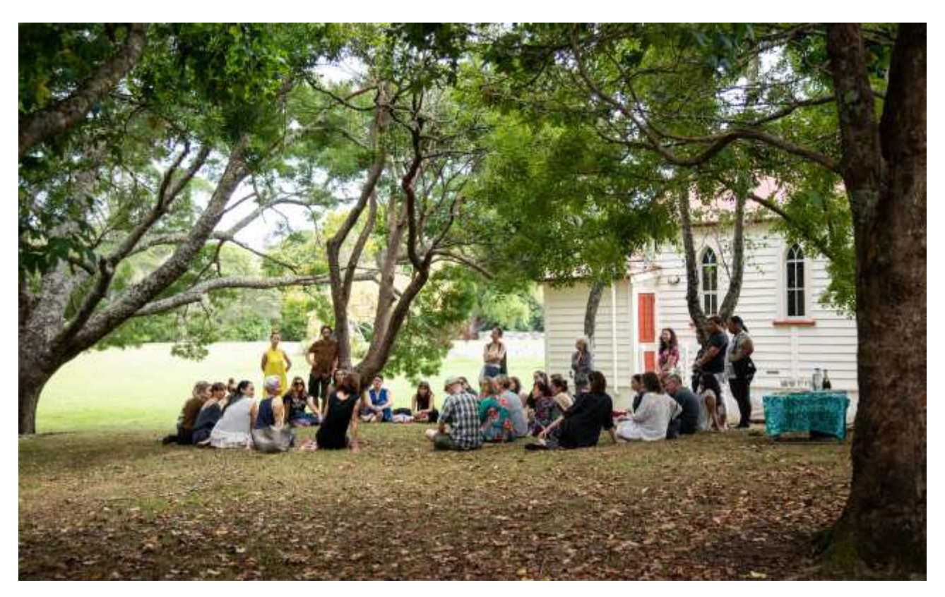
Figure 9: Artist talks on climate change at EcoFest West