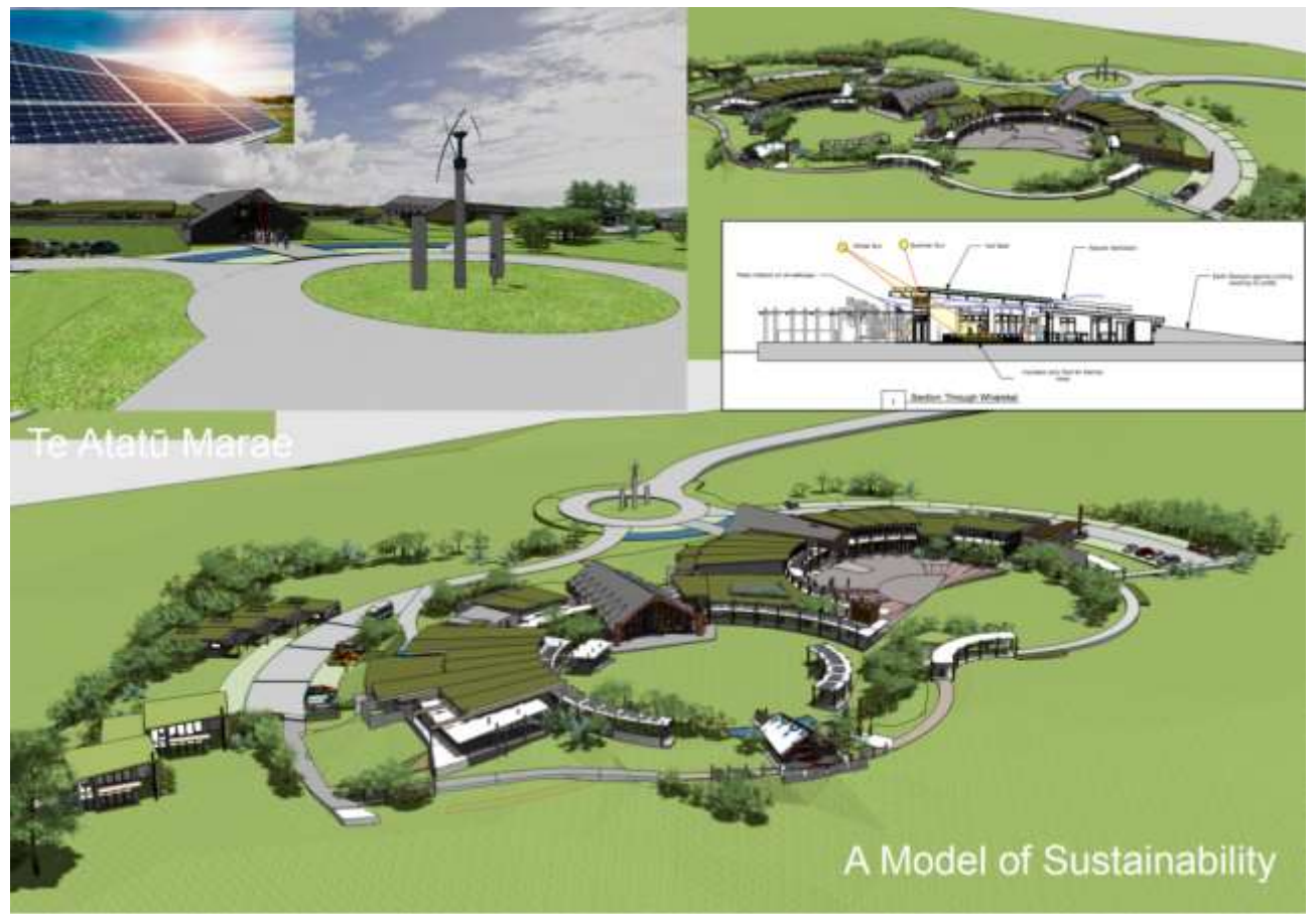
Figure 12: Te Atatū Marae complex development

The Te Atatū Marae is not just a vision for the next generation but for the next 200 years.