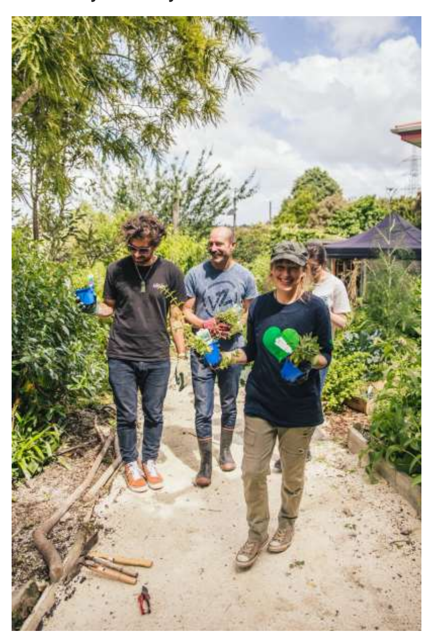
Figure 11: Planting herbs and vegetables with EcoMatters

Grow My Kai is helping more Aucklanders get started to grow their own kai. EcoMatters developed the idea in response to the issues of local food security and resilience highlighted during the COVID-19 pandemic. Their community garden, nursery and composting experts have helped grow thousands of vegetable seedlings so that more Aucklanders can start growing their own simple, healthy kai. EcoMatters Environment Trust works with community partners, including VisionWest and Family Action, to get the seedlings to households they support.