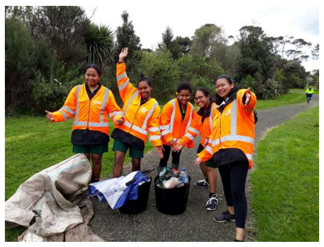
Figure 2: Project Twin Streams litter removal in Urlich Reserve with St Dominic's volunteers

Project Twin Streams (PTS) is a large-scale environmental project that engages West Auckland communities in restoring streams in their local neighbourhoods. Since 2003, over 881,446 native trees and shrubs have been planted and volunteers have contributed more than 70,000 hours.